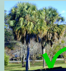
Cabbage or Sabal Palm

Most often, non-native ornamentals are planted to beautify people's yards. Many exotic invasives, or plants that are not originally from Florida and take over their surrounding habitat, have been introduced this way. Below are just two of the exotic invasives we are trying to eradicate from our area.